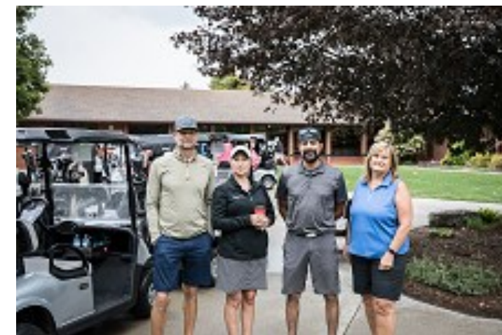
Covid was still around but Westover was able to host the Annual Charity Golf Tournament at Maple City Golf and Country Club